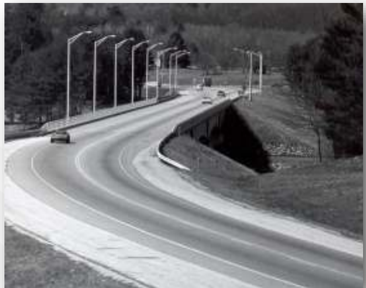
Original Sagamore Bridge "Connecting South End of Hudson at Lowell Road to Route 3 Nashua"

The first to be completed was The Veteran's Memorial Bridge (northern span); constructed alongside and parallel to the aging concrete Taylor's Falls Bridge. Following 15 months of construction this bridge was opened in September 1970. State officials then made the decision to permanently close the old bridge. This set the stage for the construction of the southern