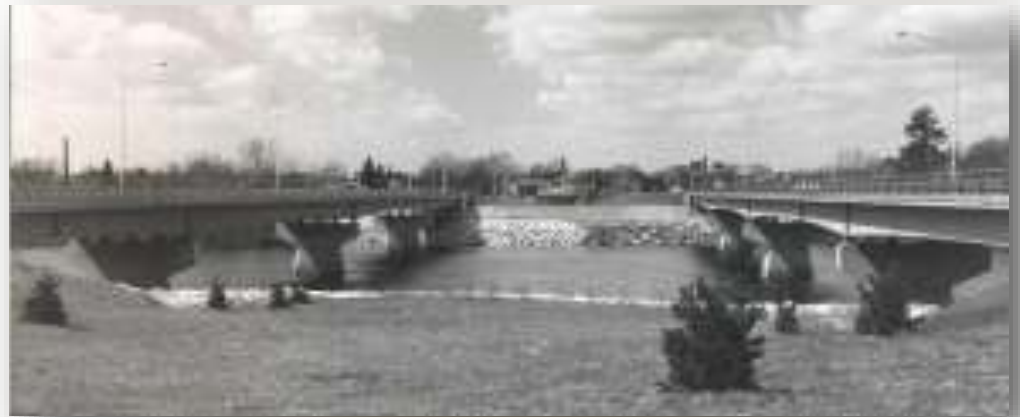
Twin Span c1975 "Veterans Memorial and Taylor's Falls Replacement Bridges"

IN THIS, THE FOURTH AND FINAL ARTICLE IN THE SERIES, WE LOOK AT THE TWIN SPAN BRIDGE ACROSS THE RIVER WHICH HAS SERVED OUR TOWN SINCE THE 1970'S