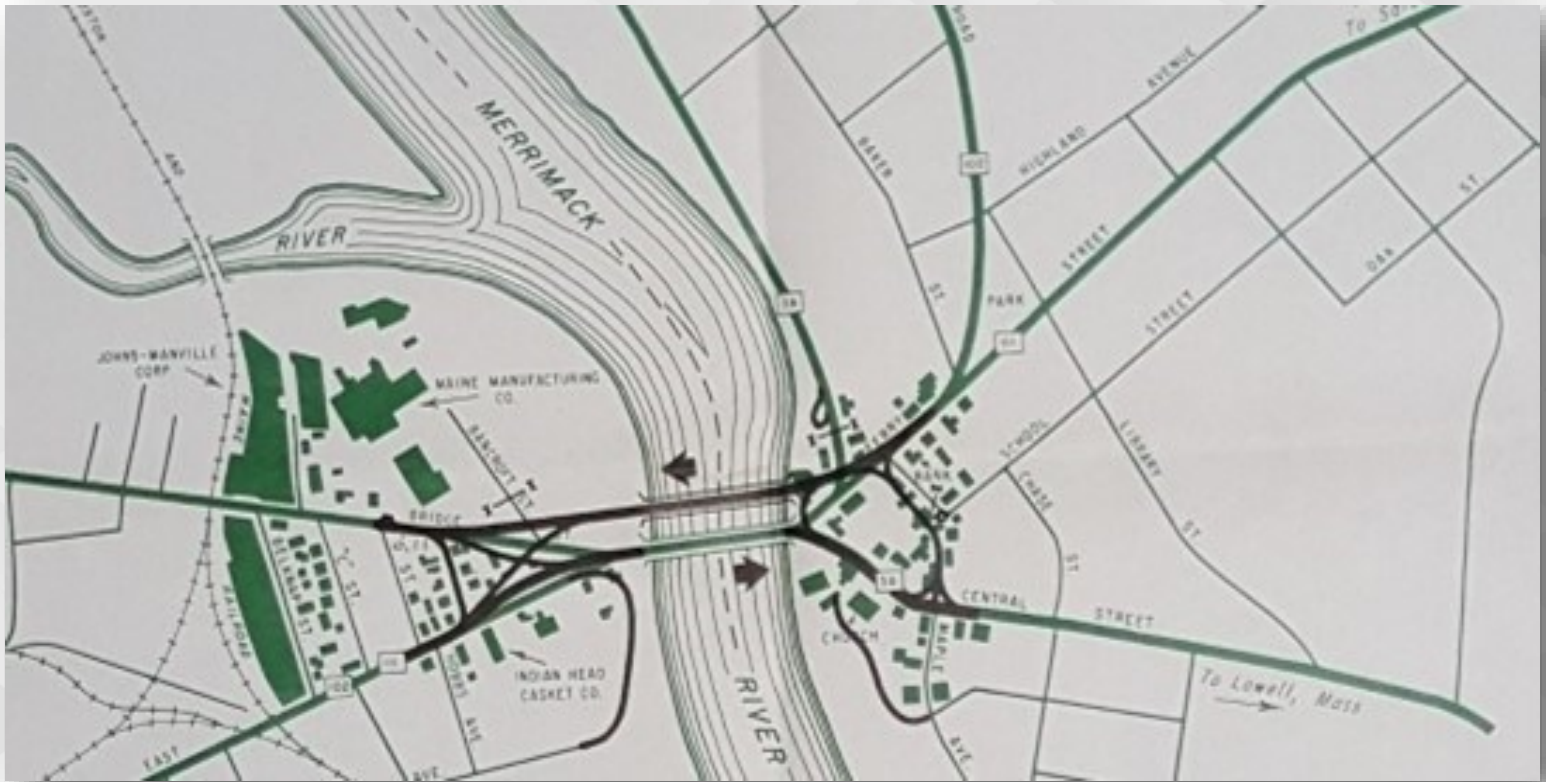
State Plans c1967 "State of NH Plans for Bridge Construction"

By October 1967 the State issued this map showing the proposed bridge and access routes. Access to the proposed bridge would go through the 20th Century Building and eliminate part of Webster Street. This plan did include a rotary on the Hudson side, which was later eliminated with plans to extend Chase Street from School Street to Ferry.