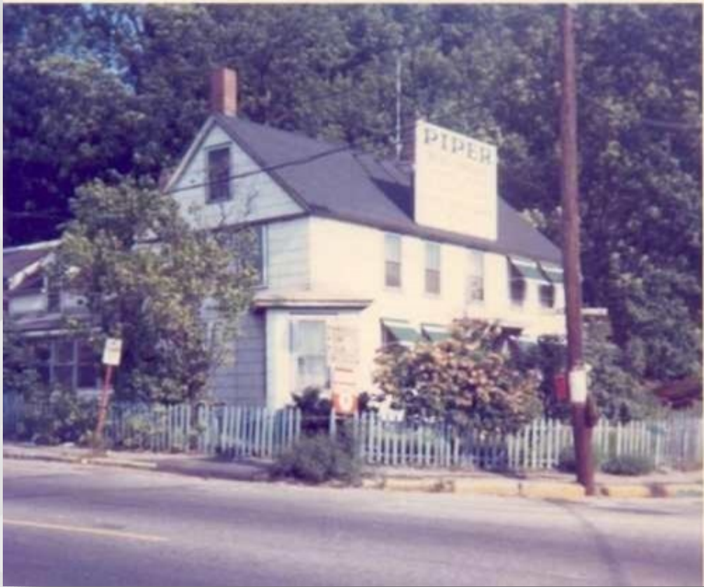
Martin Building PO Square "Martin Building at Ferry and Central"

Library Park. Initially it was thought that the old 'trolley stop' would also be demolished; but, in the final planning it was saved. The traffic pattern included the extension of Chase Street, which previously ended at School Street, through to Ferry Street. Driving on Ferry Street today heading toward the bridge, there is no evidence of these buildings; in fact, one wonders how there was even enough room for this complex to exist! The only possible reminder of the old roadway is the dead end of Baker Street or a possible relic of an old foundation.