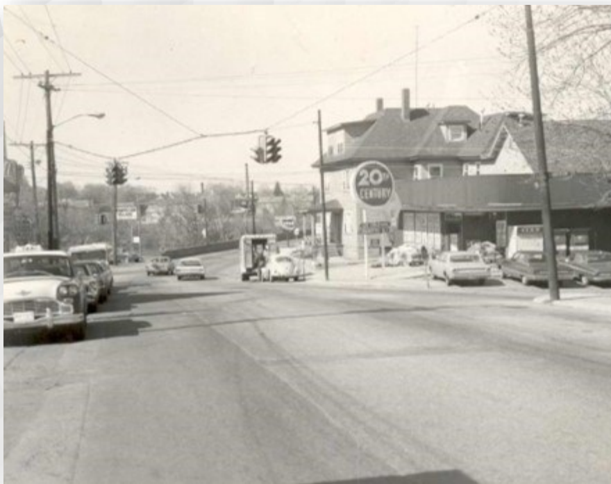
20th Century "Popular Grocery Store at PO Square—Gone in Favor of New Bridge"

The State of NH identified land frontage and specific properties to be taken along Ferry, Webster, and Central Streets. Many residents remember those times and the major impact the demolition and construction had on individuals and businesses. Gone are the 20th Century complex, the White Cross Superstore, the Morey Building, a Dry Cleaning shop, and Chick n' Chips, along with frontage north to Library Street. The intersection of Baker Street onto Ferry Street was eliminated, and Baker became a dead end street. Frontage, including 26 shade trees, was removed from