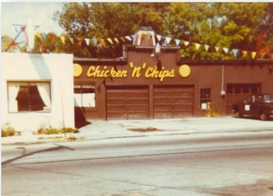
Chick n' Chips "Chip n' chips on Ferry Street—gone in Favor of Access Roads"