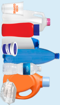
Plastic Bottles, Jugs, Tubs, & Lids (Empty kitchen, laundry, & bath containers & clamshells)