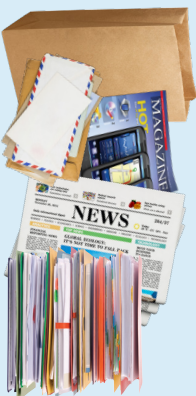
Junk Mail, Periodicals, & Office Paper (Paper bags, envelopes, & catalogs)