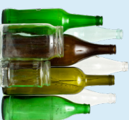
Glass Bottles & Jars (Empty food & beverage bottles & jars)