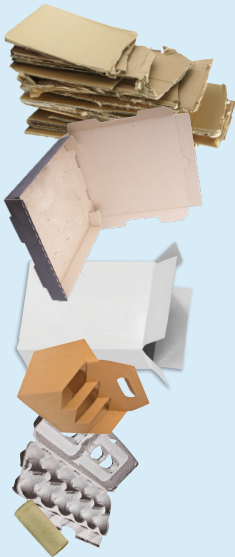
Cardboard & Boxboard (Clean & dry)